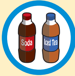
Limit Sugar-Sweetened Beverages