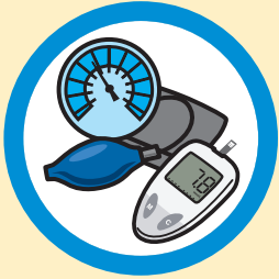
Monitor My Blood Sugar and/or Blood Pressure