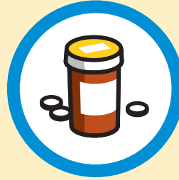
Take My Medicine