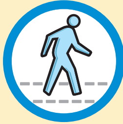
Be Physically Active