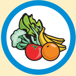
Eat a Healthy Diet